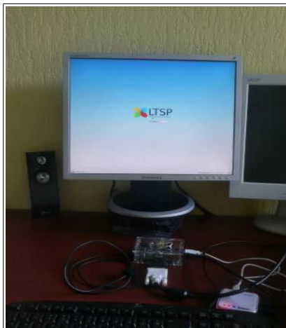
Plate 1 : Raspberry PI as Thin Client.

An ideal thin client is the computer hardware without hard drive and well equipped with dedicated mini motherboard which depends on the central server for processing data and connects to the server through network to run application, access files, print, and perform all services available in on ordinary computer. Plate 1 shows Raspberry PI working as thin client using edubuntu's LTSP.