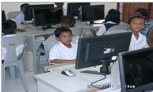
Plate 3 : Tamil school students using open source Thin Client in an ICT lab.

The open source thin client computing environment currently implemented in Malaysian Tamil schools have been well received with 70 over schools been teaching ICT and Tamil since 2009. With the use of Raspberry PI as thin client, the performance of the lab can be enhanced further. The cost to implement the lab can also be reduced substantially. The server based open source technology making it easier for students and teachers to organize and access education materials and multimedia content. At the same time the thin client network enables the schools to use this technology more effectively to monitor students work. With open source applications and thin client technology it was possible to decrease the cost of installation and the cost of maintaining the computer lab. With servers installed at each and every schools, the setting up of centralized school management system is now possible. With centralized school management system in place, teaching and training materials can be deployed to every schools at realtime. This will enhance greater sharing of knowledge between schools, universities, individuals and even between countries, pushing the envelop to further height for the growth of Tamil language and Tamil community.