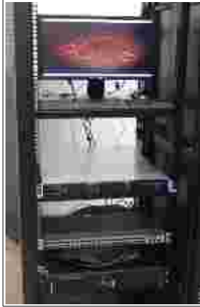
Plate 2: Centralized Raid Server

An ideal thin client is the computer hardware without hard drive and well equipped with dedicated mini motherboard which depends on the central server for processing data and connects to the server through network to run application, access files, print, and perform all services available in an ordinary computer. Plate 1 shows Raspberry PI working as thin client using edubuntu's LTSP.